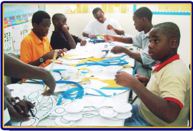
Arts and Craft activities at Summer Camp 2006.