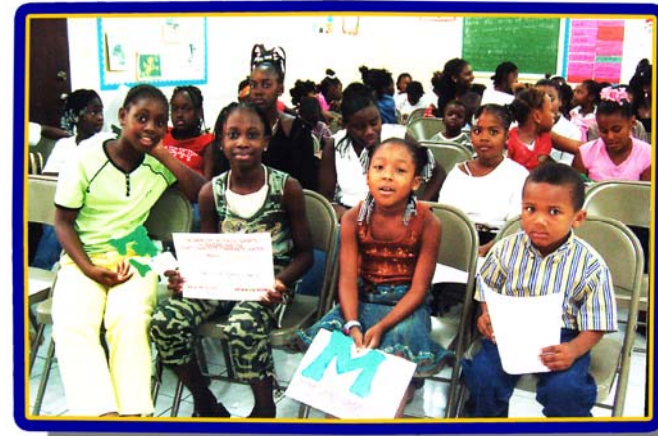
Summer Camp 2006 closing ceremony .