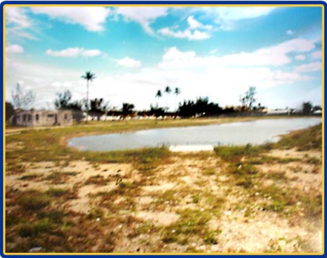
Pond created in the re-engineering of the Chippingham Drainage Canal.