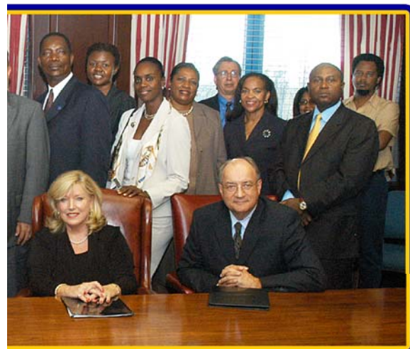
Private and Public Partnership meeting in the office of the Prime Minister in 2006.

I call on all residents of all political, religious and ethnic backgrounds in the Fort Charlotte Community to share in and expand this vision for the development of the Fort Charlotte Community.