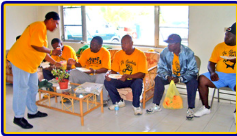
Fort Charlotte campaign team members take a much need lunch break.