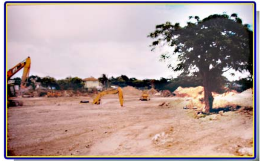
Construction site of the new T. G. Glover Primary School.