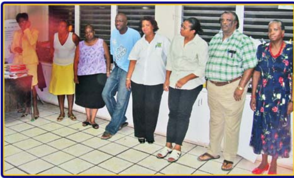
Officers of the Fort Charlotte Branch of the Progressive Liberal Party after their election in 2006.