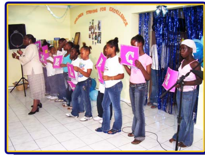
A performance at the Fort Charlotte Community Centre Summer School Programme in 2006.