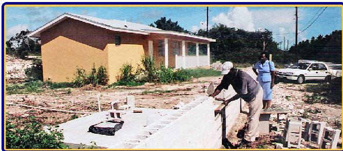
Preschool nearing completion , Driggs Hill , South Andros.