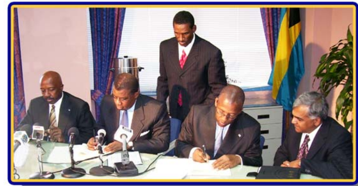
Signing of $23 million loan with the Inter-American Development Bank to