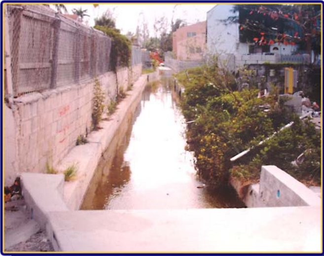
Chippingham Drainage Canal