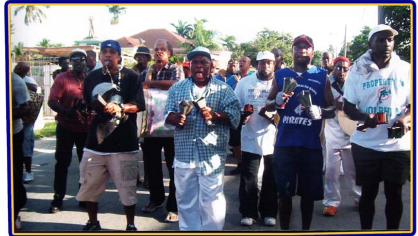
Fort Charlotte Christmas Festival at C. I. Gibson Park 2006