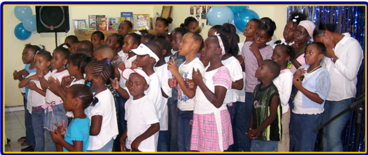
Closing performance at the Fort Charlotte Community Centre Summer School Programme in 2006.