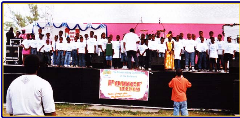
Children from Fort Charlotte Community Centre giving a culture presentation at Fort Charlotte Arts and Craft Festival.