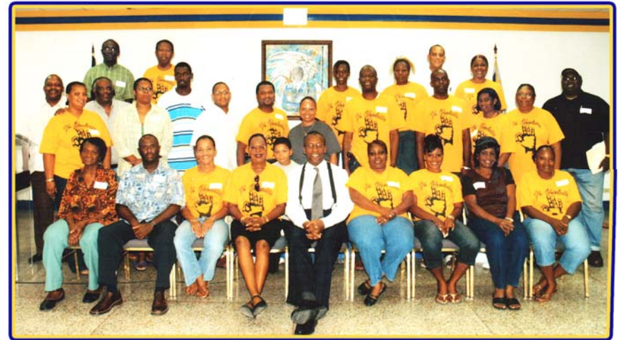
Training session for Fort Charlotte campaign team in 2006.