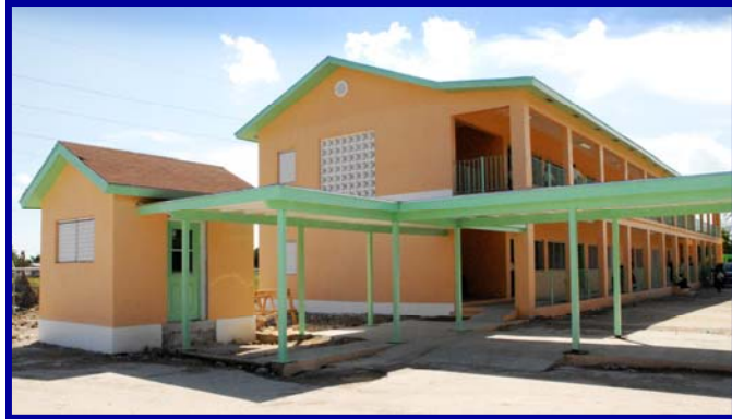
Mable Walker Primary School new classrooms and Security booth constructed in summer 2006